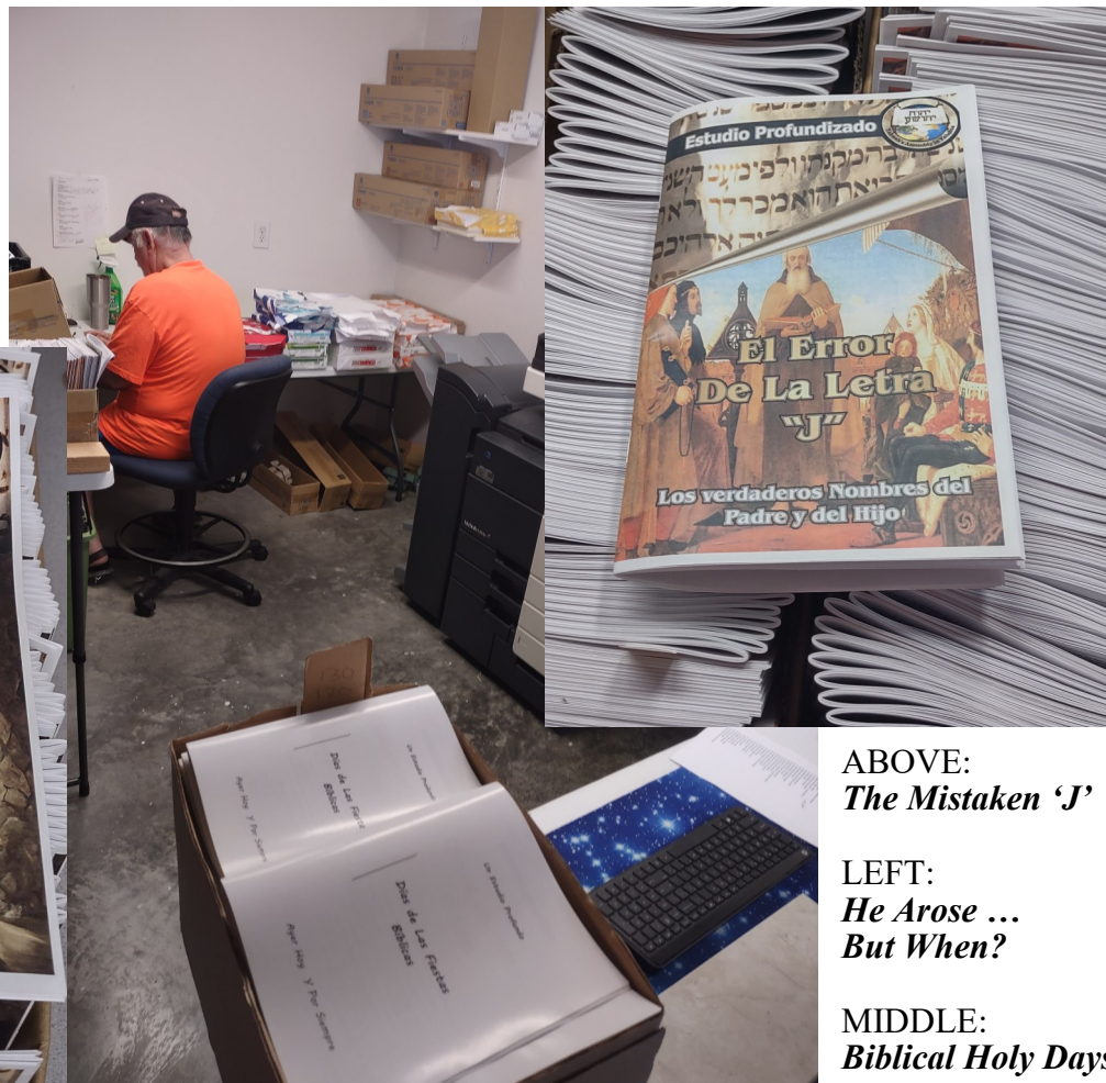
ABOVE: The Mistaken 'J'

Yahweh has recently allowed us to reach out to Cuba with the Spanish literature. We are grateful to see the Word go out and around the world to areas that are in need of the truth of Yahweh's Word. HalelluYah!